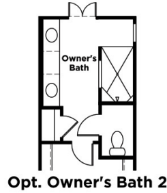
Opt. Owner's Bath 2